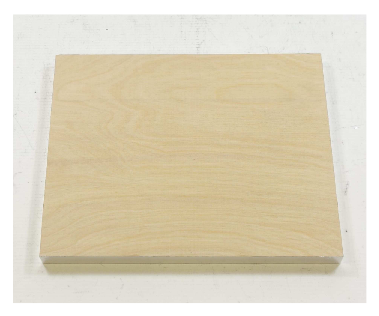
A001: Birch plywood Riga Ply BB/WG EXT-LN 18 mm