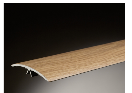
Reducer strip: From laminate to ceramic, vinyl etc