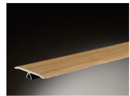
T-moulding: From laminate to laminate