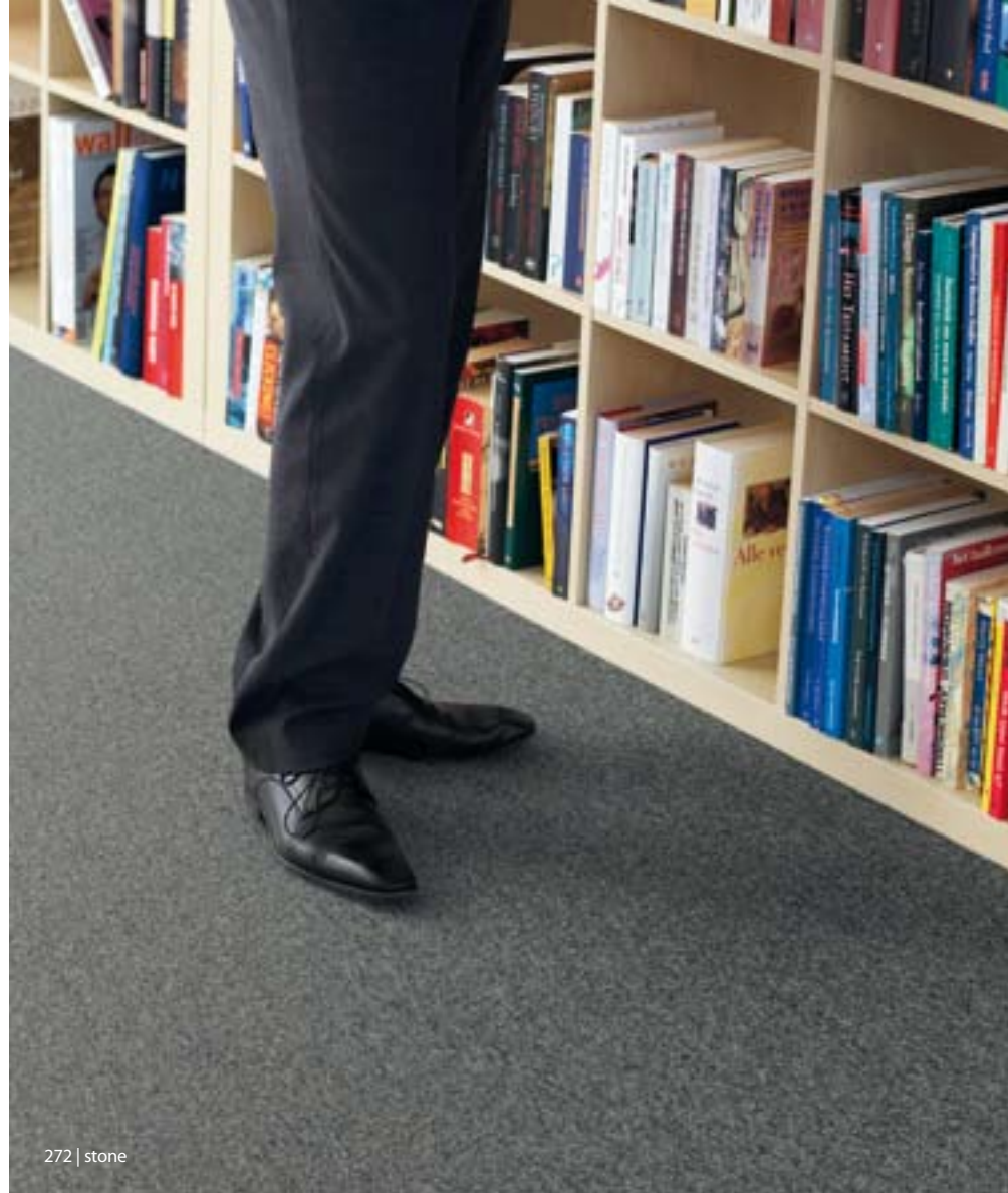
272 | stone