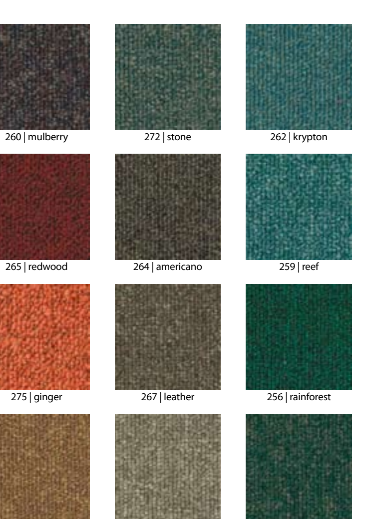
270 | caramel