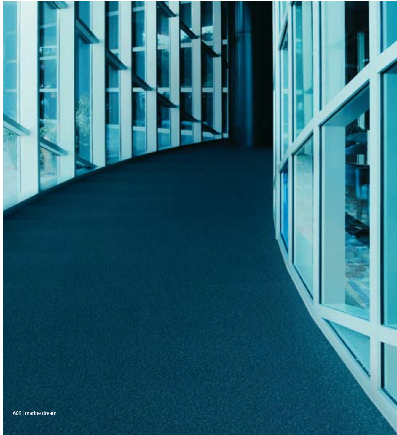
609 | marine dream