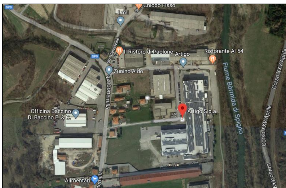
0-1 Aerial photo of the site

The site covers a surface area of approximately 14,000 m 2 , comprising the following: Offices, Compound Production Department, Finished Flooring Production Department, Warehouses and Research and Development Laboratory.