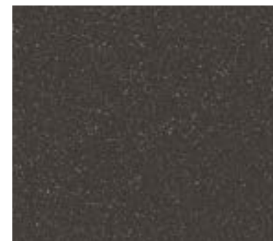
Jet 9974 NCS S 8000-N w/r 9842 LRV 7.9