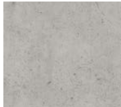
Light Industrial Concrete 9969 NCS S 2500-N w/r 9860 LRV 35.1