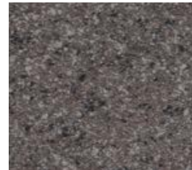
Onyx 9983 NCS S 7502-R w/r 9805 LRV 13.7