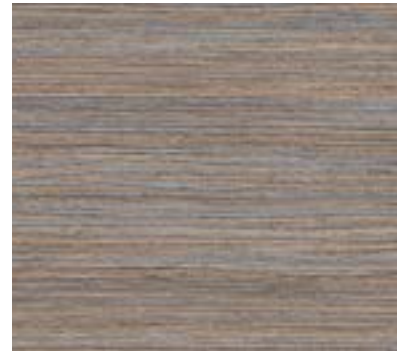
Autumn Rain 9986 NCS S 5005-Y80R w/r 9864 LRV 24.2