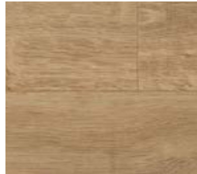
English Oak 9957 w/r 9823 LRV 24.2