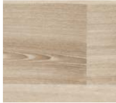
Warm Limed Ash 9953 w/r 9832 LRV 34.1