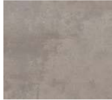
Warm Concrete 9967 NCS S 3502-R w/r 9855 LRV 25.0