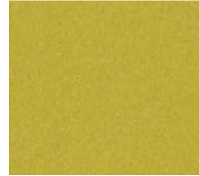
Meadow 9980 NCS S 2050-G90Y w/r 9850 LRV 31.7