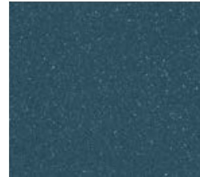
Steel Blue 9977 NCS S 6020-B10G w/r 9852 LRV 9.9