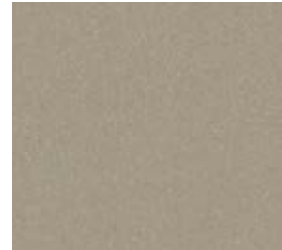
Moleskin 9975 NCS S 3005-Y20R w/r 9841 LRV 27.8