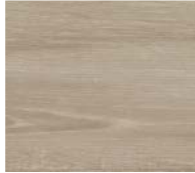
Sun Bleached Oak 9952 w/r 9825 LRV 31.4