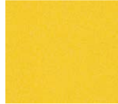
Flaxen 9979 NCS S 0560-Y w/r 9849 LRV 43.9