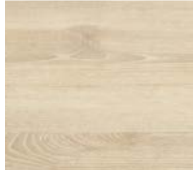
Classic Limed Ash 9955 w/r 9833 LRV 48.7