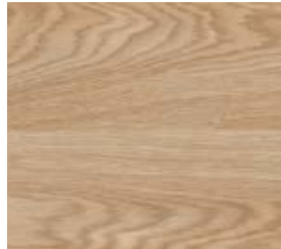
Blond Oak 9956 w/r 9820 LRV 27.7