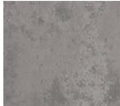
Cool Concrete 9966 NCS S 4500-N w/r 9856 LRV 21.9