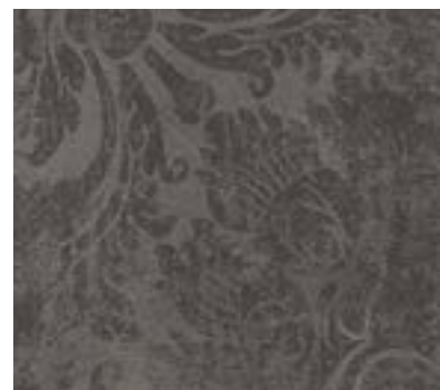
Onyx Ornamental 9972 NCS S 7000-N w/r 9862 LRV 11.0