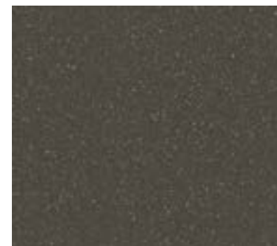
Taupe 9976 NCS S 7502-Y w/r 9843 LRV 9.5