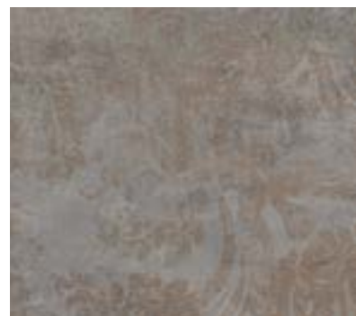
Copper Ornamental 9971 NCS S 5502-R w/r 9861 LRV 18.8