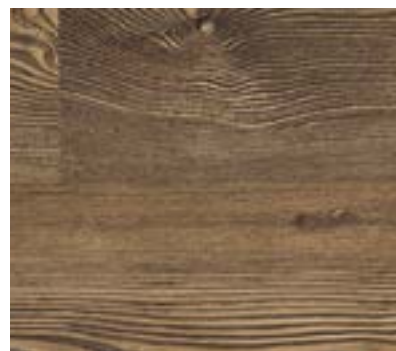
Bronzed Pine 9962 w/r 9835 LRV 14.3