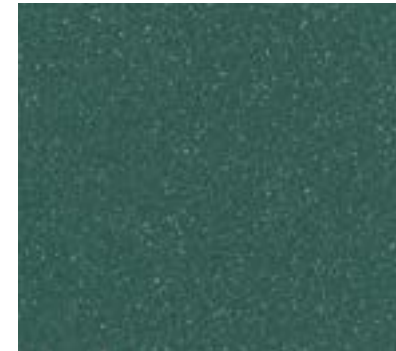
Teal 9978 NCS S 6020-B70G w/r 9851 LRV 11.0