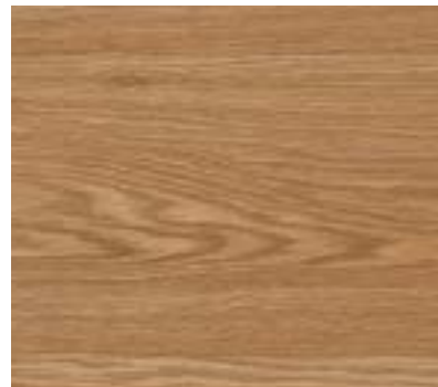
Honey Oak 9959 w/r 9821 LRV 22.0