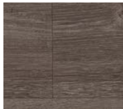
Smoked Oak 9963 w/r 9827 LRV 11.3