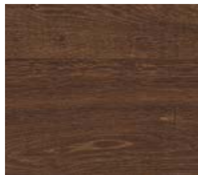
Aged Oak 9961 w/r 9824 LRV 8.1