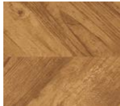
Reclaimed Chevron 9958 w/r 9830 LRV 17.3