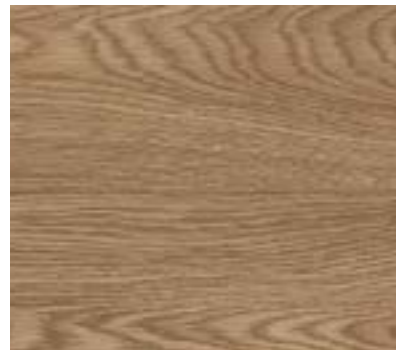
Toasted Oak 9960 w/r 9822 LRV 18.2