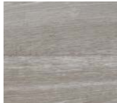
Silver Oak 9951 w/r 9826 LRV 27.6