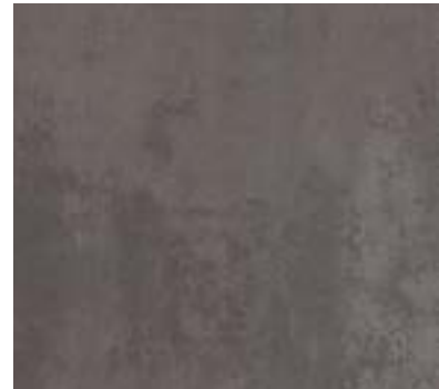
Dark Grey Concrete 9968 NCS S 6502-R w/r 9857 LRV 12.8