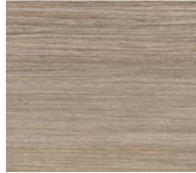
Honey Beige 9985 NCS S 3005-Y50R w/r 9869 LRV 29.2