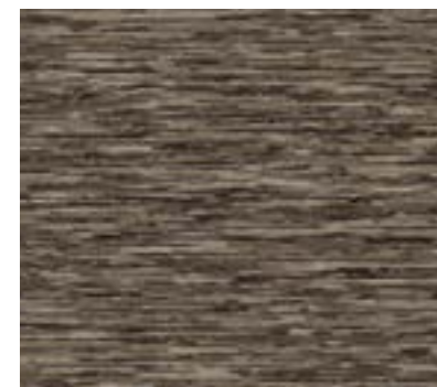
Twilight 9984 NCS S 7005-Y20R w/r 5086 LRV 14.1