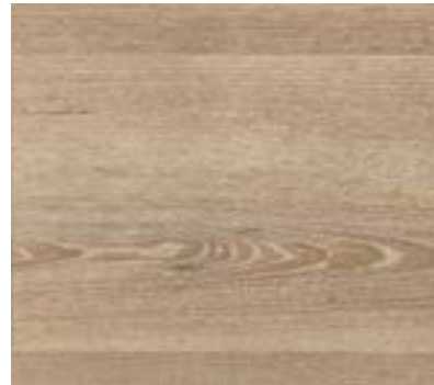
Roasted Limed Ash 9954 w/r 9831 LRV 27.3