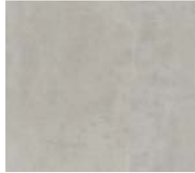
Light Grey Concrete 9965 NCS S 3000-N w/r 9858 LRV 40.2