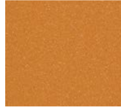
Burnt Orange 9981 NCS S 3040-Y40R w/r 9848 LRV 24.0