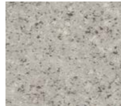
Zinc 9982 NCS S 3500-N w/r 9804 LRV 37.2