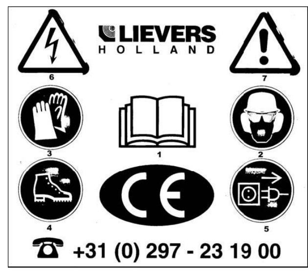
Figure 2: safety symbols