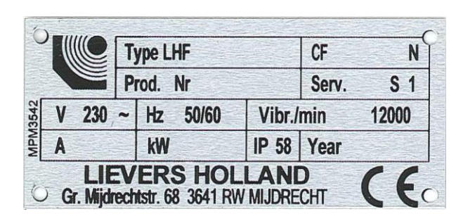
Figure 1: example ratingplate LHF-E

The ratingplate can be found on the switch cover.