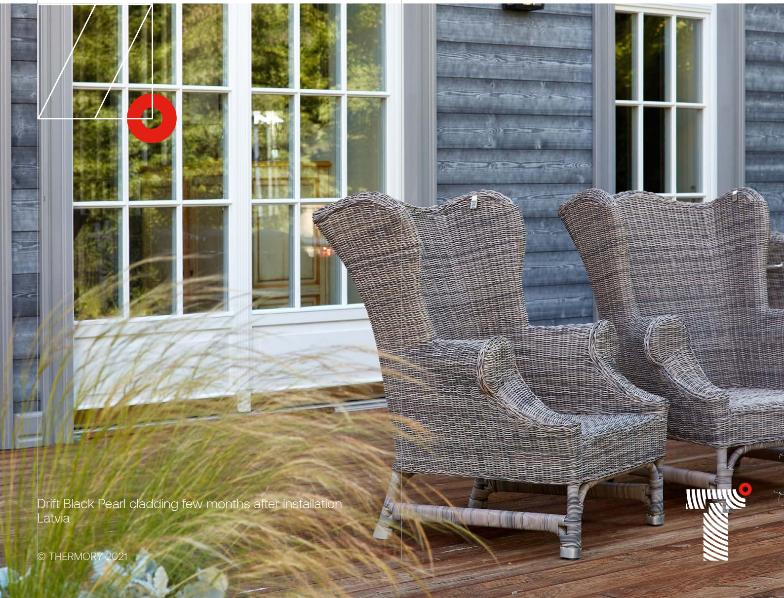
Drift Black Pearl cladding few months after installation Latvia