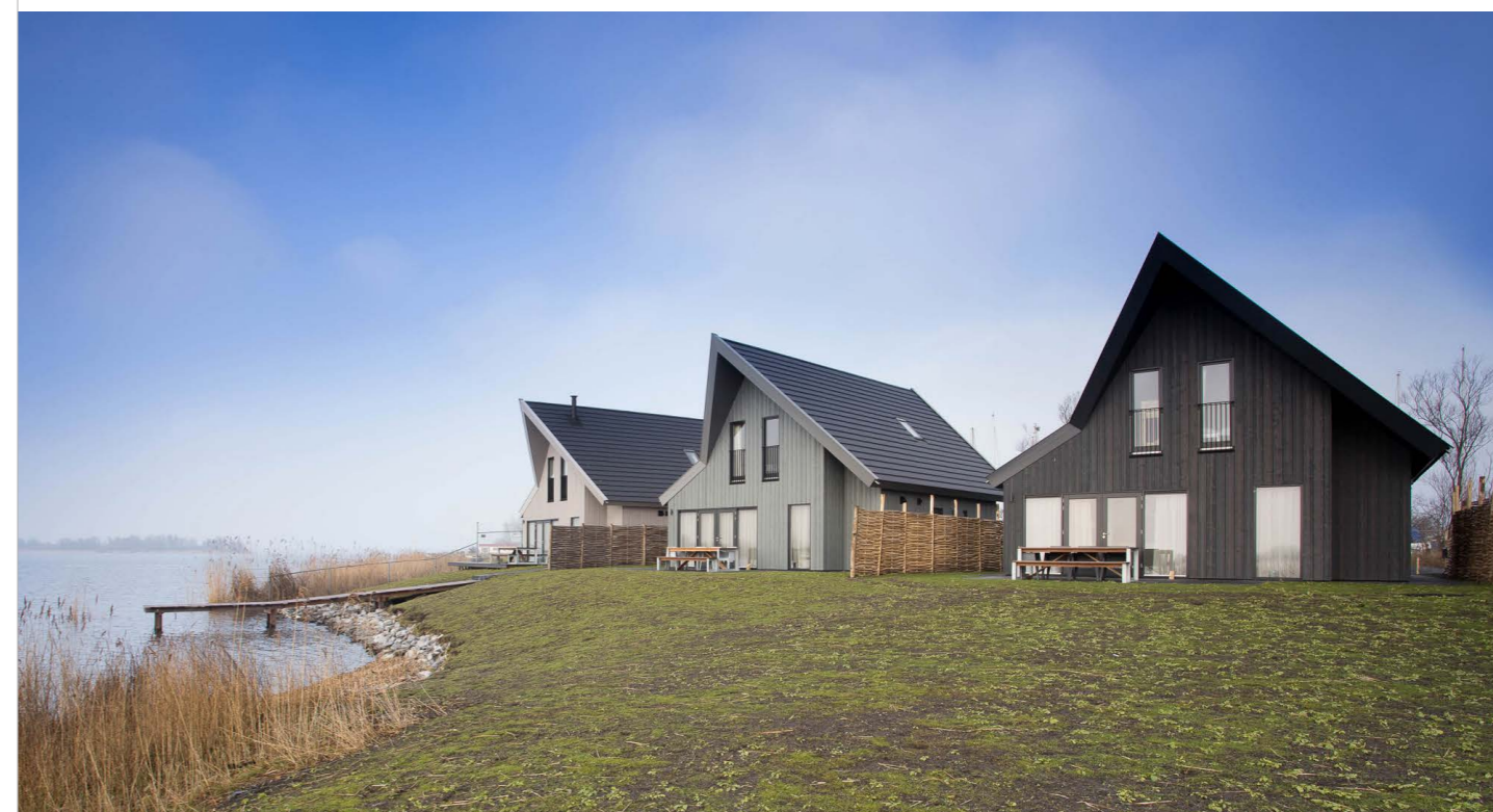
Vivid Opaque thermo-spruce cladding. Holiday Houses in Netherlands Distribution & Photography InterFaca

For Vivid Opaque 15 cladding, we recommend applying a maintenance finish whenever the paint layer wears down to leave the cladding board with an uneven appearance, and at least every 15 years, with a water-based opaque paint that is approved for use on exterior thermally modified wood cladding.