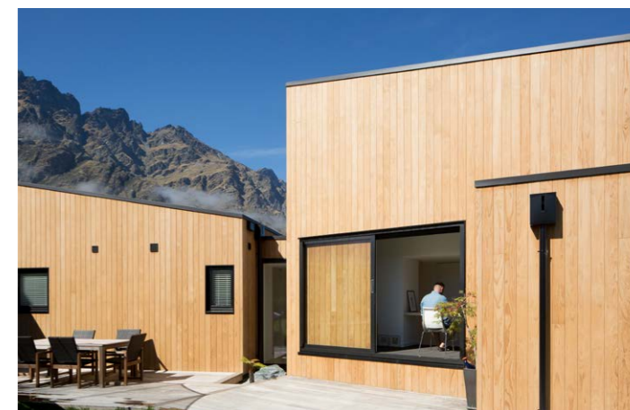
Benchmark thermo-radiata pine cladding. Jack's Point House in New Zealand