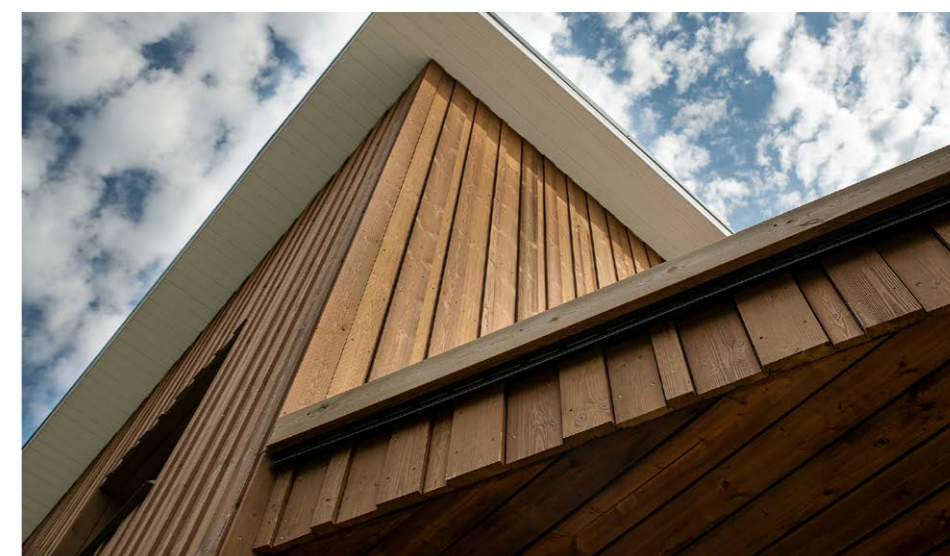
Vivid Translucent 7 Brown. Private house in Estonia

To finish, choose a semi-translucent (semi-opaque) water-based paint based on the tone you want to achieve for your façade.