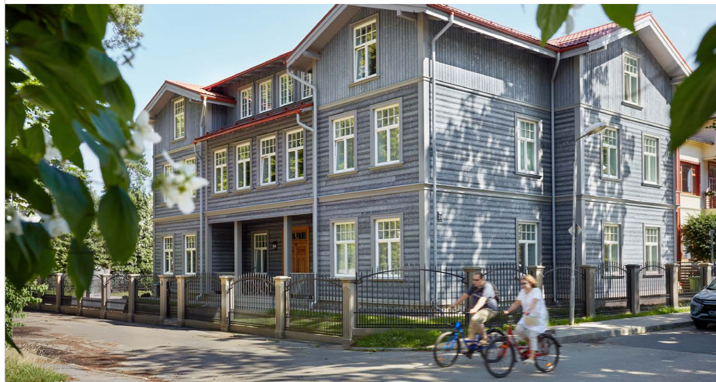
Drift Black Pearl thermo-spruce cladding. Private house in Latvia