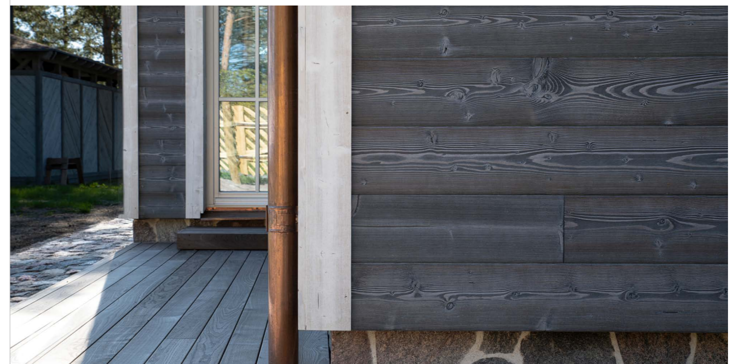
Drift Platinum and Sandy Pearl thermo-spruce cladding. Private house in Estonia