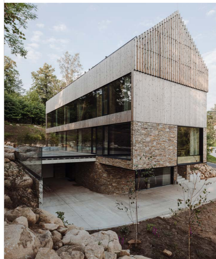
Uncoiled Benchmark thermo-pine cladding and roofing one year after installation. Apartments in Poland