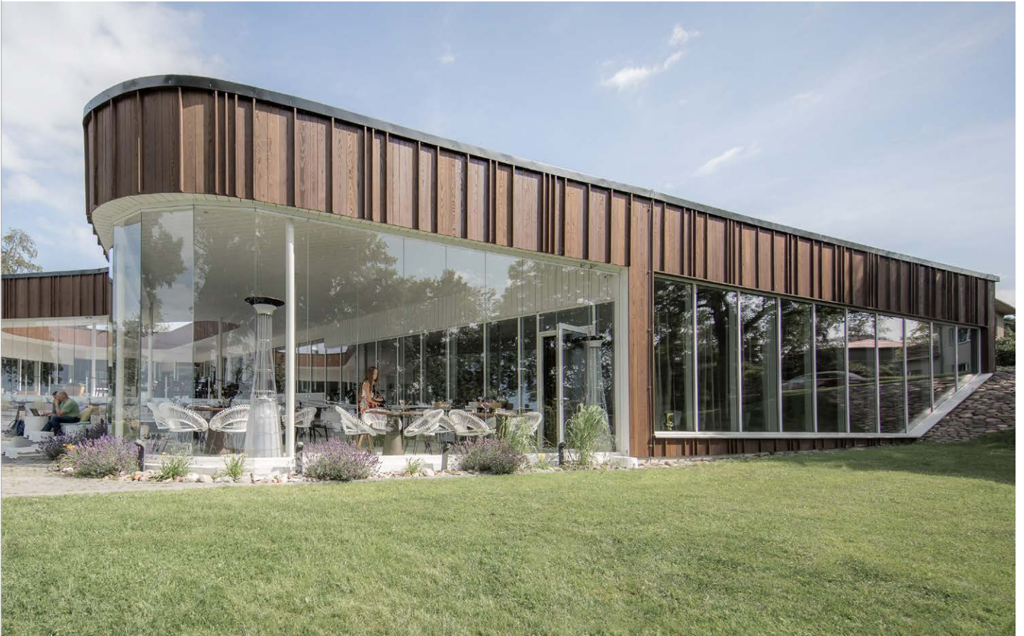
Oiled Thermory Benchmark thermo-ash cladding. NOA Restaurant in Estonia