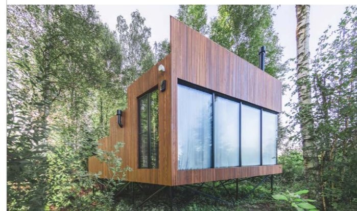
Thermory Benchmark thermo-ash cladding few months after installation. Maida Nature Resort in Estonia