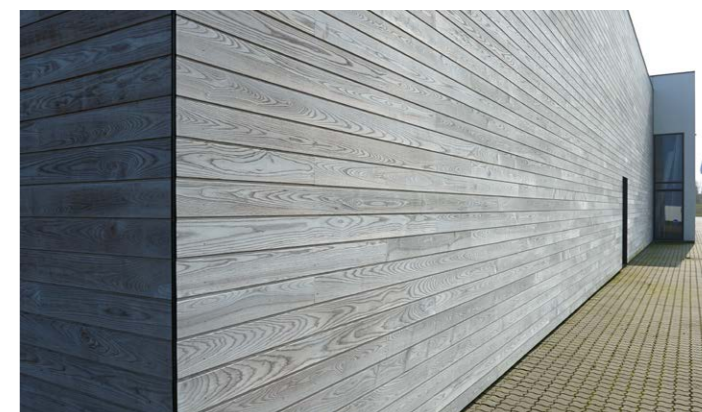
Uncoiled Thermory Benchmark thermo-ash one year after installation Denmark